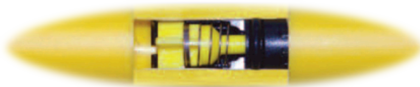
EFV Cross Section